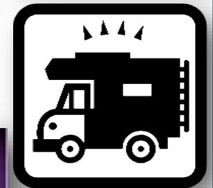
ROLLING ELKS CLUB