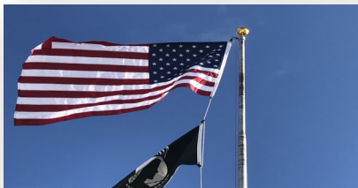
We honor our Military