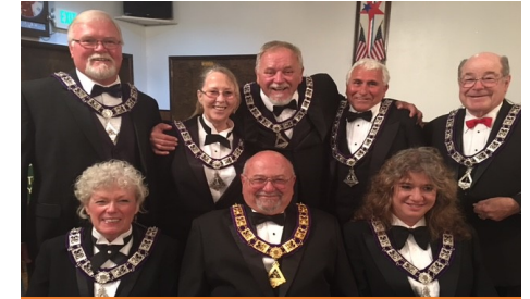
CONSIDER BEING AN OFFICER!!